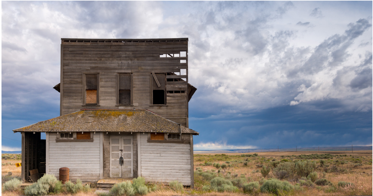
A building in Kent in Sherman County.