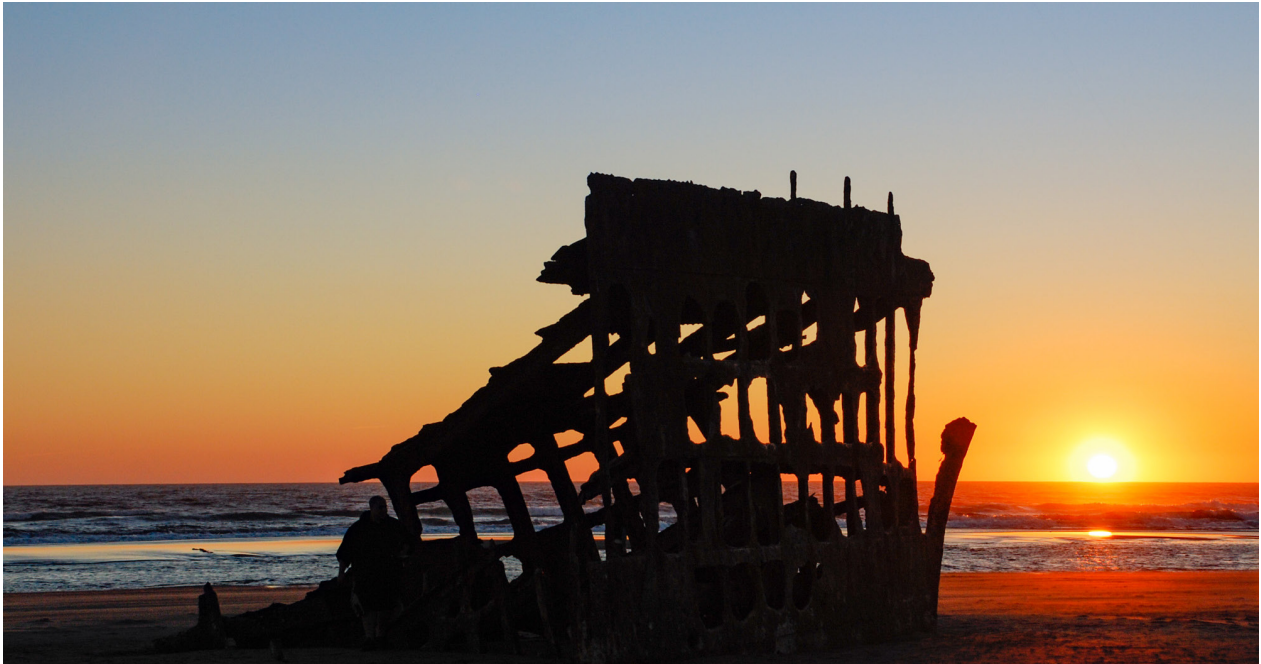
Shipwreck of the Peter Iredale in Fort Stevens State Park in Clatsop County.