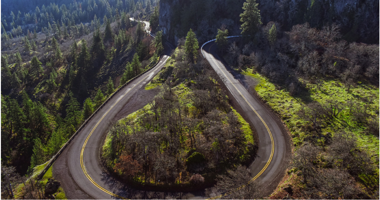
Rowena Crest in Wasco County.