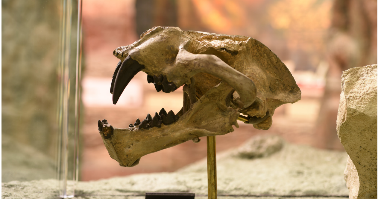
A fossil exhibit at the Thomas Condon Visitor Center in Grant County.